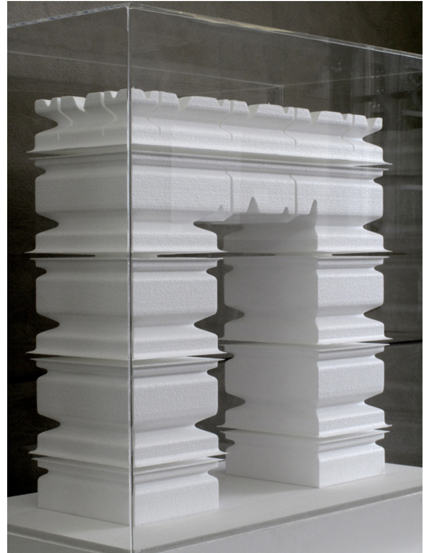
ECG arch, 2009, 59cm(H) x 58cm x 22cm, polystyrene

Here, I've taken a representative ECG cycle from a recent recording of my own condition, and created a set of instructions for a computer controlled hot-wire to cut through block polystyrene.