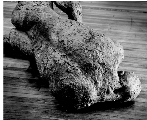
sediment I , 2007, 86cm(H) x180cm x 80cm, mud & other media