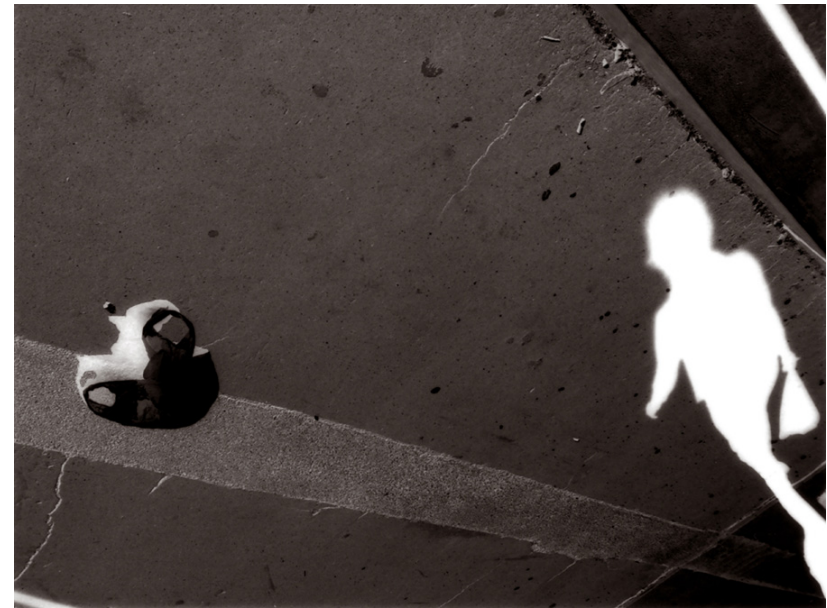
the plastic bag gets away, 2008, 20.5cm x 27.5cm, giclée print

In some ways this treatment may serve as a truer representation of the momentary and incidental nature of individual existence and conditioning.