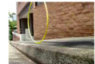
the yellow hoop 2008, duration 1:53