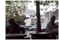
dialogue 2009, duration 1:22