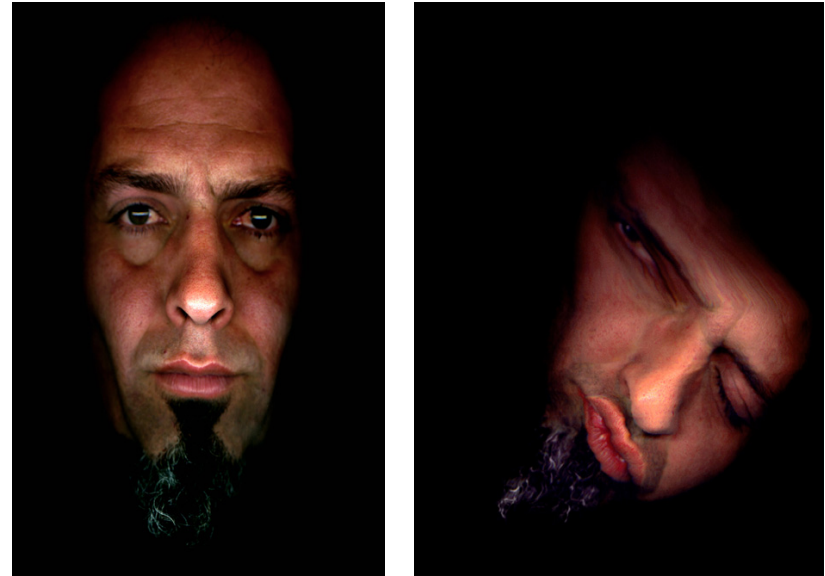
narrow past , 2009, left image, 100cm x 65cm, giclée print

In the scanning, as each observed slice becomes digitally frozen, the next is still a free proposition – though only for moment longer.