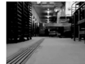
delivery - a little metaphor 2009, duration 4:54