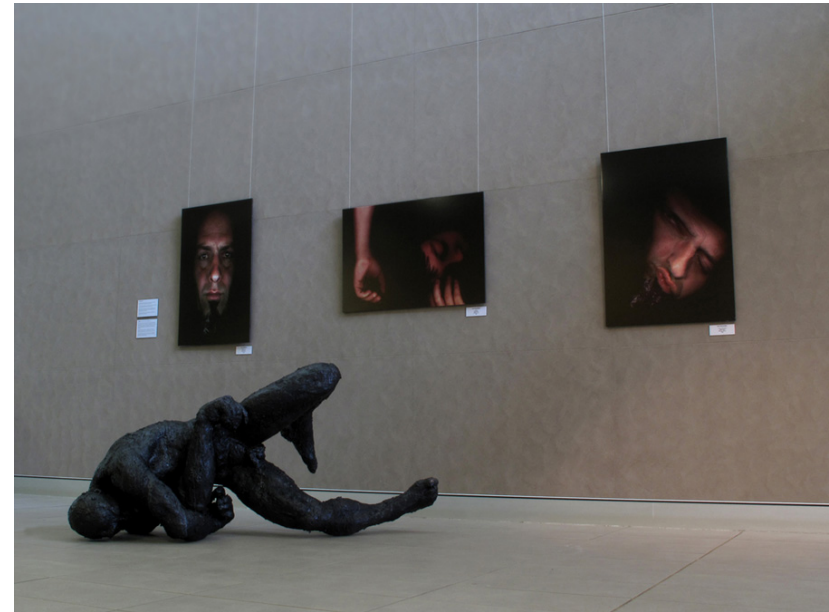
exhibition image showing sediment I , 2007, and scanned portraits