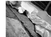
a taste of blood 2009, duration 4:35