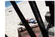
hollow promise - cottlesloe 2009, duration 2:35