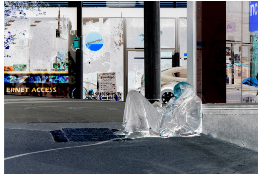
sediment true , 2009, 39.5cm x 57.5cm, giclée print

Within my practice the negative image is actively explored for its own aesthetic and metaphoric potential. Here however it is also a means of protecting his anonymity.