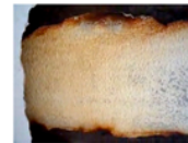
origin of species 2009, duration 1:11