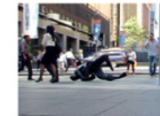
sediment I 2008, duration 1:50